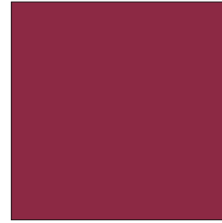
PMS 209 Maroon

Claflin University Typeface: Book Antiqua